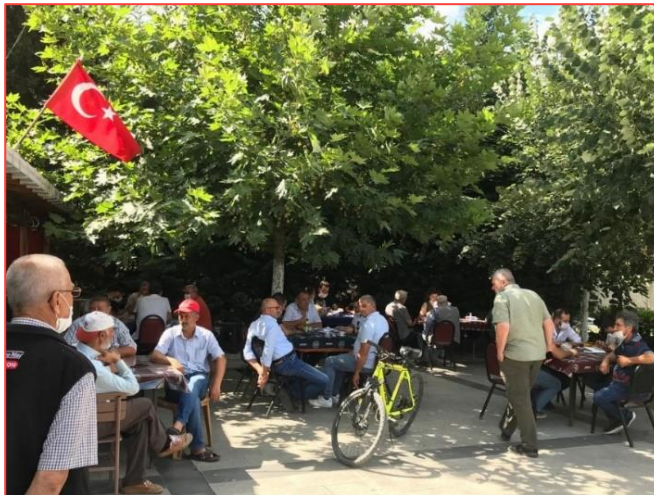
Figure 3-1 - Community Focus Group Meeting

3.2.14. Table 3-5 provides the results of the focus group meetings.