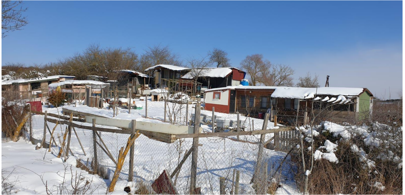
Figure 3-3 - Land Parcel used by Beekeeper

3.2.16. No additional vulnerable groups were identified as part of the additional consultations.