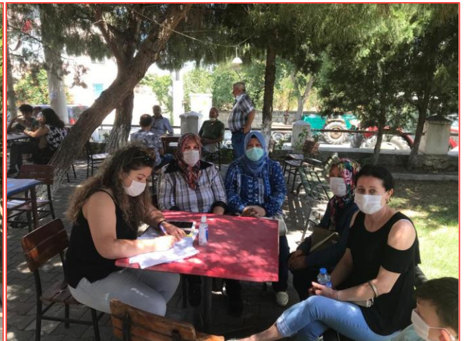
Figure 3-2 - Women Focus Group Meeting